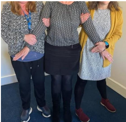
Reference: Straight arm immobilisation 6