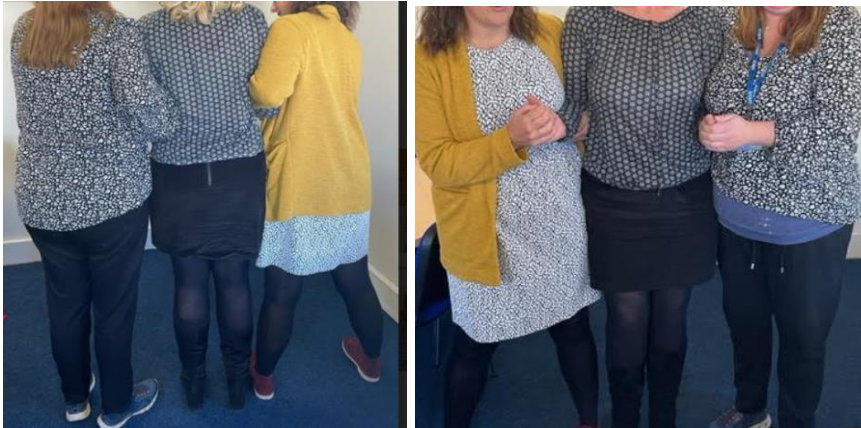
Reference: Double cup hold 5