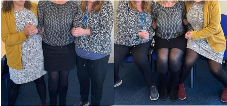
Reference: Seated rest position 7