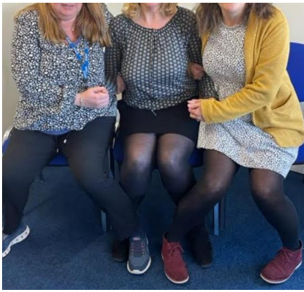
Reference: Seated kicking position 8