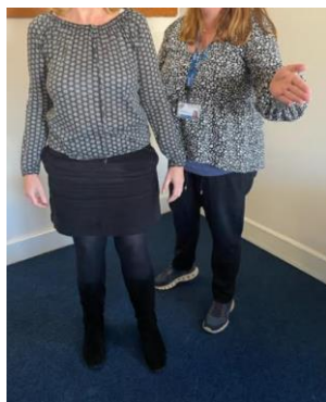
Reference: Prompting 2