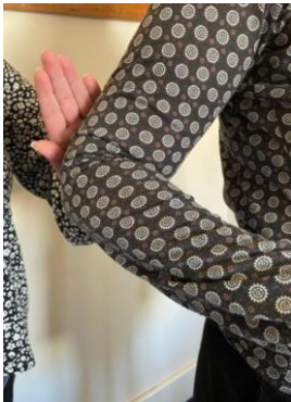
Reference: Prompting 1