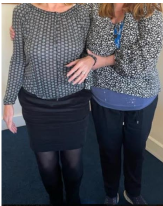
Reference: Escort 4