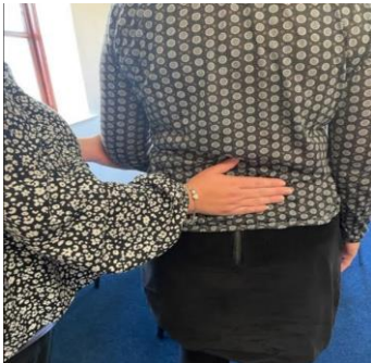
Reference: Guiding 3