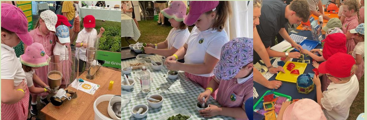
Glebeland Sports Day – come and join us!